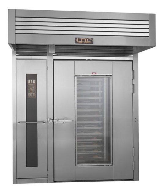
Model LRO-2E4 Shown (Rack not included)